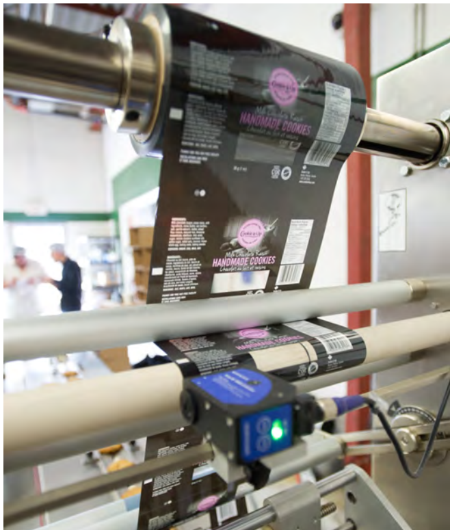
The automatic film registration on the Sleek 50 Wrapper machine helps ensure uniform package consistency for each run.