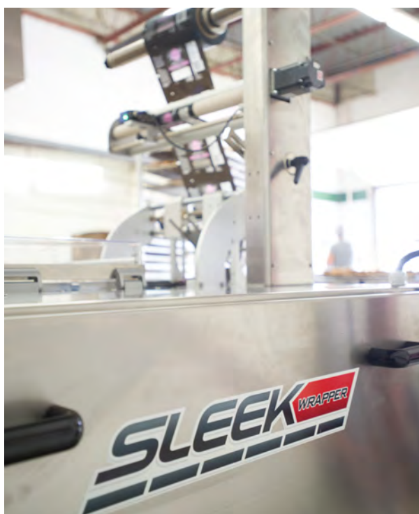
All of the Sleek Wrapper flowwrapping machines manufactured by Paxiom feature sanitary stainless-steel surfaces to meet all stringent requirements for food safety.