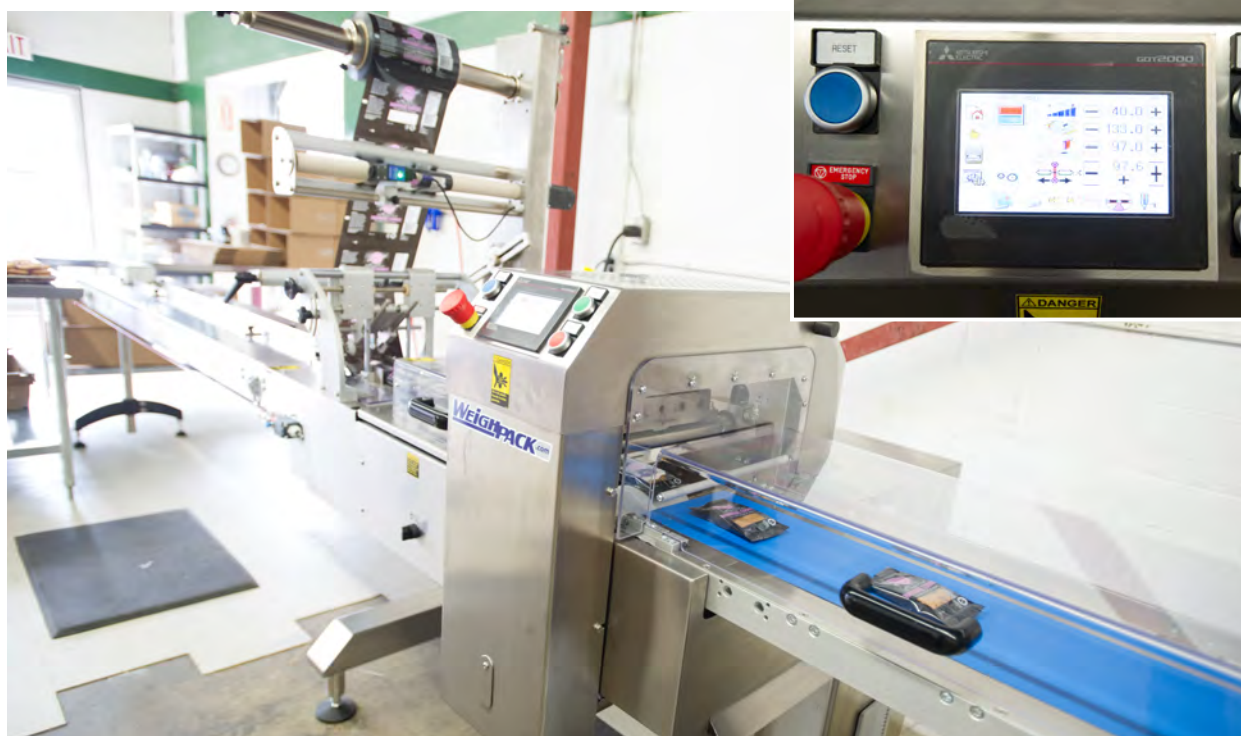
Installed at the Cookie It Up bakery in Aurora in early May of this year, the model Sleek 50 Wrapper horizontal flow-wrapper from Paxiom is controlled via a user-friendly PLC touchscreen interface ( inset ) to enable the plant to produce more than 50 single-serving pouches of freshly-baked cookies per minute in smooth-running, low-noise process.