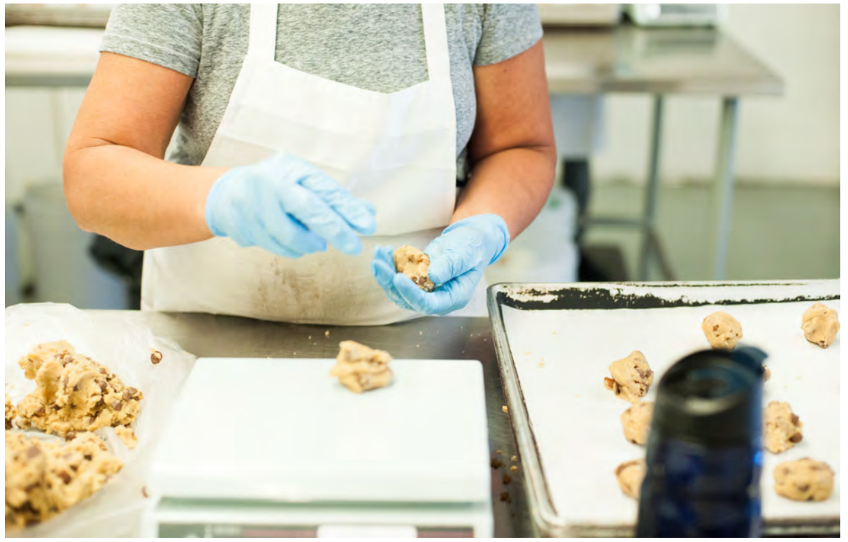
Each and every cookie produced at the Cookie It Up facility is formed and shaped by hand by one of several line operators from the freshly-mixed slabs of dough (above left) blended to right consistency on a nearby Hobart mixer.