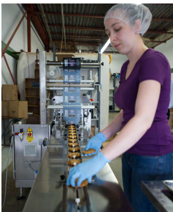
A machine operator manually places freshly-baked cookies onto the infeed conveyor track of the new Sleek 50 Wrapper flowwrapping machine manufactured by Paxiom.